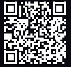
TRB145 360° VIEW

// TRB145 is a mission-critical LTE Cat 1 gateway, equipped with RS485 interface.